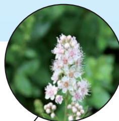
Large-leaved Meadowsweet Spiraea latifolia