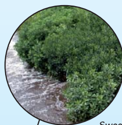
Sweet Gale Myrica gale

A visual guide can be useful as you work. Download this poster at www.crelaurentides.org