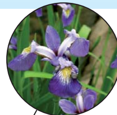
Larger Blue Flag Iris versicolor